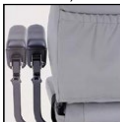
Width adjustable armrest