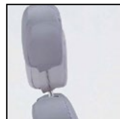
Height adjustable headrest