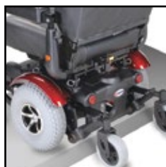
6" caster on front & rear for maximum stability