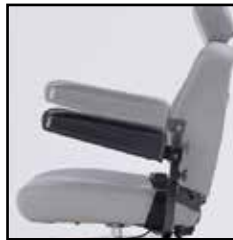
Height adjustable armrest