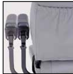
Width adjustable armrest