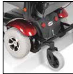
True six wheel design