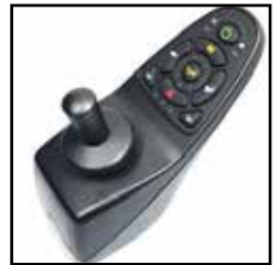
Dynamic Shark Controller