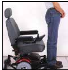
Excellent stability on footplate