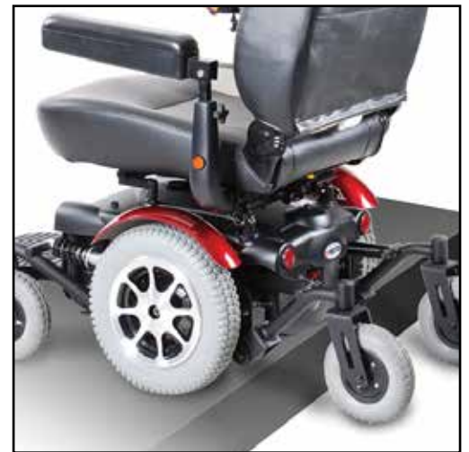
Built to navigate everyday obstacles